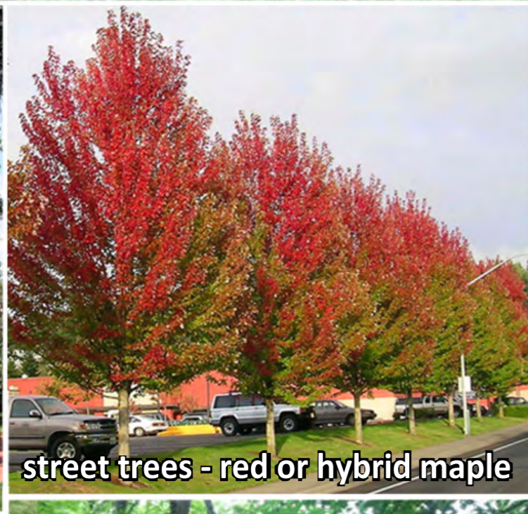
street trees - red or hybrid maple