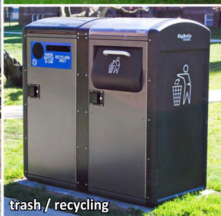
trash / recycling