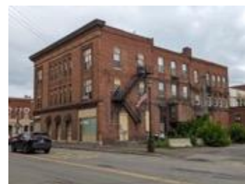
2023 Aroostook County Residency

In 2023, we provided financial support for Araxine Wilkins Sawyer Foundation (Greene), Avesta Housing (Portland), Bangor Historical Society (Bangor), Bar Harbor Historical Society (Bar Harbor), Bearnstow (Mount Vernon), Colonial Theater, Inc. (Augusta), Ellsworth Historical Society (Ellsworth), Farmington Historical Society (Farmington), Fifth Maine Regiment Museum (Peaks Island), Friends of the West Durham Methodist