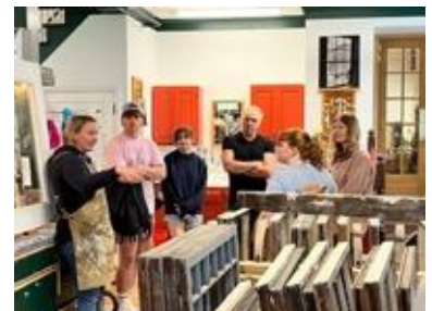
2023 Summer Fellows at Bagala Window Works