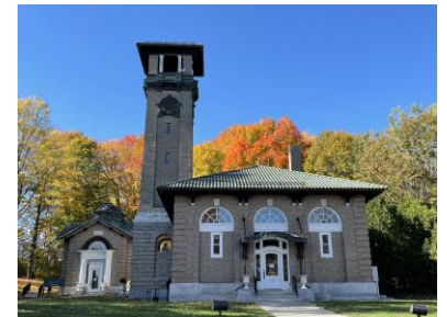
1999 Honor Award Winner: Poland Springs Bottling Plant and Spring House

Our Most Endangered Historic Places list focuses statewide media attention, boosts local advocacy efforts, and enlists engagement to save threatened assets. This year’s list includes Bowdoinham Town Hall, Jonathan Fisher House (Blue Hill), Swan Island, Colburn House (Pittston), Gayety Theatre (Van Buren), D’Amanda’s Candlepin Bowling (Ellsworth), and Winter Harbor Historical Society Museum.