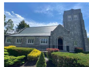
2022 Grant Awardee, Poland Springs Preservation Society