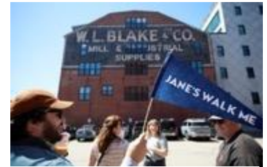
2023 Jane's Walk, Portland's Ghost Signs

We advocate on the state and national level for effective preservation policy to support the rehabilitation