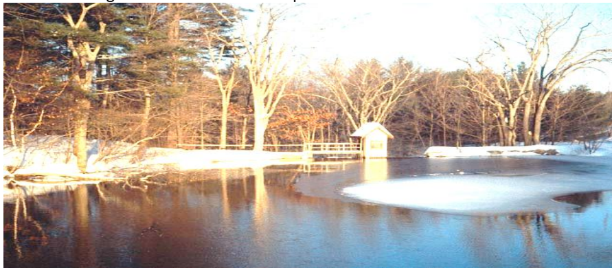
The dam in 1973. This has long been a scenic Poland spot. A bridge will preserve the beauty while enhancing the Brook Trail and enjoyment of the area.

For a number of years the Conservation Commission has been working toward completion of Waterhouse Park, the area around the dam and pond adjacent to the Fire Department on Poland Corner Rd.. This scenic area anchors a 2 mile circular trail along the old railroad bed and behind the Community School. A bridge over the dam will complete the trail.