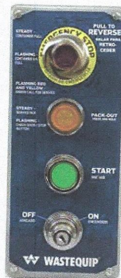
Easy-to-use 24-volt Guardian Control System (optional remote pendant shown)

* Use of an oil heater or extreme cold weather hydraulic oil is recommended in extreme cold conditions.